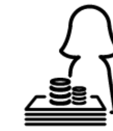
A'Cha Pe Welcome Market