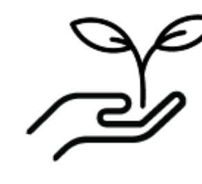
Agriculture & Financial Literacy