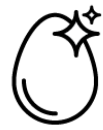
Un Huevo al Dia Nutrition Program

We support self-sustaining, community-led initiatives that empower indigenous communities. We currently operate in the Solola state of Guatemala in which 70% of children experience malnutrition. Our pilot year focused specifically in the Mayan community of San Marcos la Laguna.