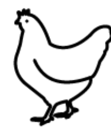
Gallinero San Marcos Hen Farm